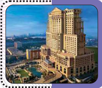
ITC ROYAL BENGAL